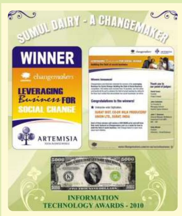
5,000 US Dollar and Award given by Change Makers on line community U.S.A. to Sumul Dairy for social upliftment in rural area by using information Technology.