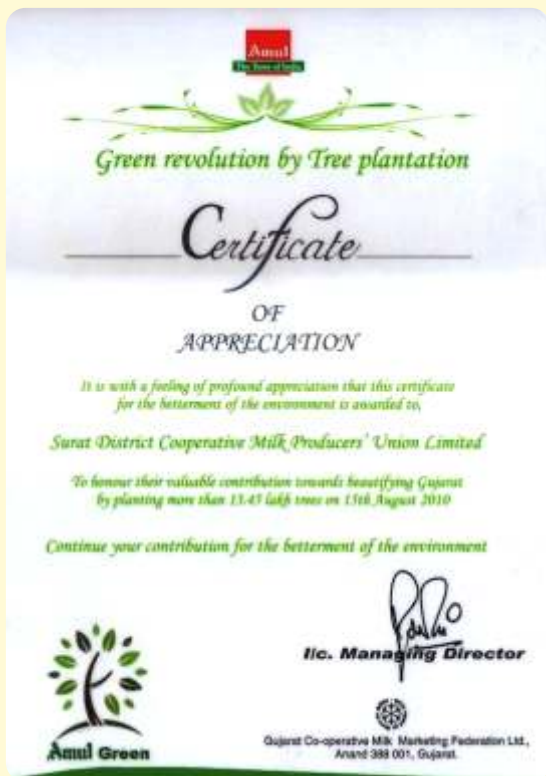
Certificate received from Gujarat Co op. Milk Marketing Federation Ltd., Anand for good work in green revolution by tree plantation.